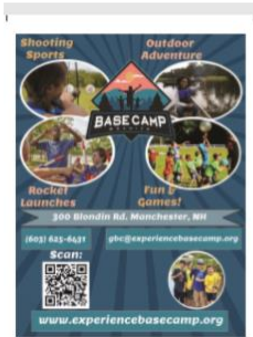
Front and back of Flyer in Mobile Base Camp: