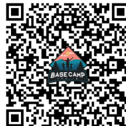
MBC Required Check In